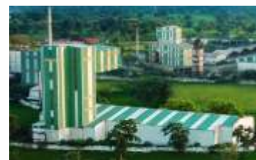
Premix Plant, Amlidih, Rajnandgaon